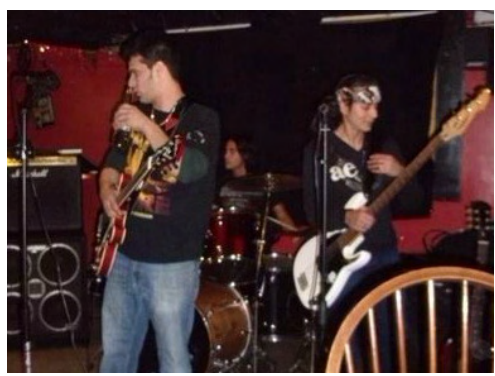
Illicit Response at Paul's Pub, Methuen, MA.